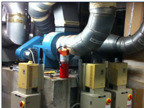
Plenums impeded maintenance (before photo). The TEL solution created redundancy and increased access by combining plenums.