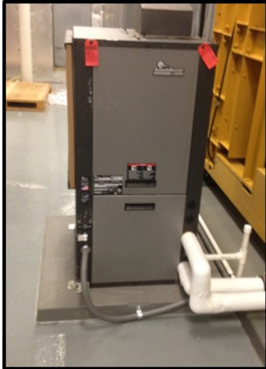
The GenHP footprint is 24"x24"x40"

These Generator Air-Source Heat Pumps Typically Achieve 75%-85% Energy Savings